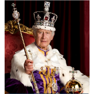
King Charles III